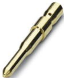
Crimp contact, turned, contact diameter: 1.5 mm, crimp range: 0.14 mm 2 ... 0.56 mm 2

Please be informed that the data shown in this PDF Document is generated from our Online Catalog. Please find the complete data in the user's documentation. Our General Terms of Use for Downloads are valid ( http://phoenixcontact.com/download )