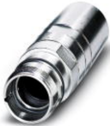
Sleeve housing for coupler connector, straight, Screw locking, M23, Shielded: Yes, Cable cross section: 6.5 mm...14.5 mm

Please be informed that the data shown in this PDF Document is generated from our Online Catalog. Please find the complete data in the user's documentation. Our General Terms of Use for Downloads are valid ( http://download.phoenixcontact.com )