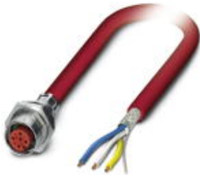
Bus system flush-type socket, CC-Link, 4-pos., M12, SPEEDCON, shielded, rear/screw mounting with Pg9 thread, with 1.0 m bus cable

Please be informed that the data shown in this PDF Document is generated from our Online Catalog. Please find the complete data in the user's documentation. Our General Terms of Use for Downloads are valid ( http://download.phoenixcontact.com )