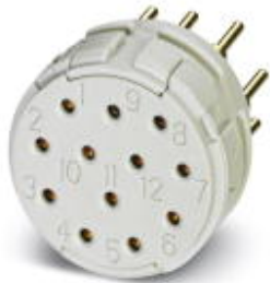
Contact insert, Number of positions: 17, Type of contact: Socket, Solder-in connection

Please be informed that the data shown in this PDF Document is generated from our Online Catalog. Please find the complete data in the user's documentation. Our General Terms of Use for Downloads are valid ( http://phoenixcontact.com/download )