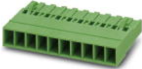
The illustration shows a 15-position version

Plug component, Nominal current: 12 A, Rated voltage (III/2): 320 V, Number of positions: 22, Pitch: 5.08 mm, Connection method: Crimp connection, Color: green, Corresponding female crimp contacts with current [A] and conductor cross section range [mm 2 ] data: 10A/MSTBC-MT 0,5-1,0 (3190564); 10A/MSTBC-MT 0,5-1,0 BA (3190645); 12A/MSTBC-MT 1,5-2,5 (3190551); 12A/MSTBC-MT 1,5-2,5 BA (3190658). BA = Bandkontakte