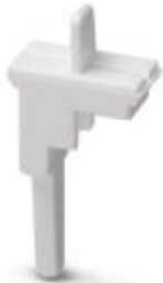
Switching lock, length: 12 mm, width: 8.2 mm, color: white

Please be informed that the data shown in this PDF Document is generated from our Online Catalog. Please find the complete data in the user's documentation. Our General Terms of Use for Downloads are valid ( http://phoenixcontact.com/download )