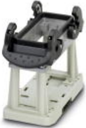
HEAVYCON connector assembly frame with panel mounting base with single locking latch, for contact inserts of type B6

Please be informed that the data shown in this PDF Document is generated from our Online Catalog. Please find the complete data in the user's documentation. Our General Terms of Use for Downloads are valid ( http://download.phoenixcontact.com )