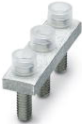
Fixed bridge, pitch: 20 mm, number of positions: 3, color: silver

Please be informed that the data shown in this PDF Document is generated from our Online Catalog. Please find the complete data in the user's documentation. Our General Terms of Use for Downloads are valid ( http://phoenixcontact.com/download )