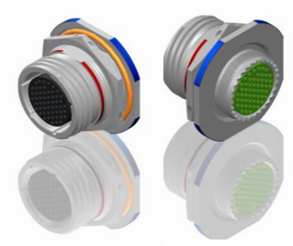
LAYOUT SHOWN AS EXAMPLE