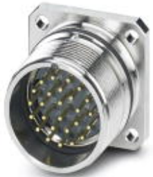
Contact carriers, M27, number of positions: 26, type of contact: Pin, Solder-in connection

Please be informed that the data shown in this PDF Document is generated from our Online Catalog. Please find the complete data in the user's documentation. Our General Terms of Use for Downloads are valid ( http://phoenixcontact.com/download )