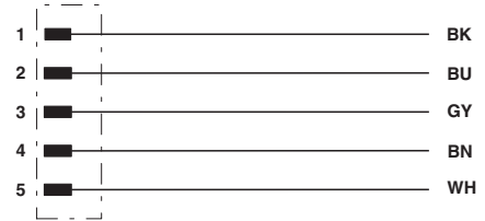
Contact assignment of 7/8" plug