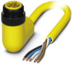
Power cable, 5-position, PVC, yellow, Plug angled 7/8"-16UNF, on free cable end, cable length: 10 m

Please be informed that the data shown in this PDF Document is generated from our Online Catalog. Please find the complete data in the user's documentation. Our General Terms of Use for Downloads are valid ( http://phoenixcontact.com/download )