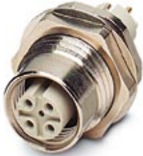
Sensor/Actuator flush-type socket, 5-pos., M12, A-coded, rear/screw mounting with Pg9 thread, with straight solder connection

Please be informed that the data shown in this PDF Document is generated from our Online Catalog. Please find the complete data in the user's documentation. Our General Terms of Use for Downloads are valid ( http://download.phoenixcontact.com )