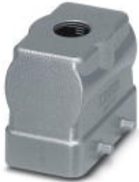
HEAVYCON B10 sleeve housing, for double locking latch, height: 72 mm, with 1 x M32 thread, straight cable outlet

Please be informed that the data shown in this PDF Document is generated from our Online Catalog. Please find the complete data in the user's documentation. Our General Terms of Use for Downloads are valid ( http://download.phoenixcontact.com )