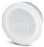
Plastic dust protection cap for connectors with M23 knurled nuts

Plastic dust protection cap - RC-Z2058 - 1604223