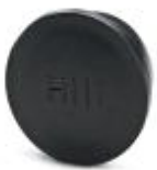
Plastic dust protection cap, anti-static, for RF, SF series connectors, with M23 external thread

Plastic anti-static dust protection cap - RC-Z2469 - 1611797