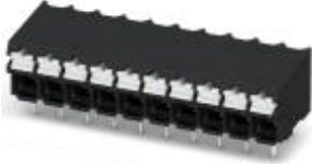
The illustration shows the 10-position version