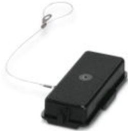
HEAVYCON protective covers, B16, for HC-EVO-B16... supporting base element, for single locking latch, with retaining cord with combination eyelet, IP54

Please be informed that the data shown in this PDF Document is generated from our Online Catalog. Please find the complete data in the user's documentation. Our General Terms of Use for Downloads are valid ( http://phoenixcontact.com/download )