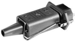
Cord retaining kits Cord retaining strain relief