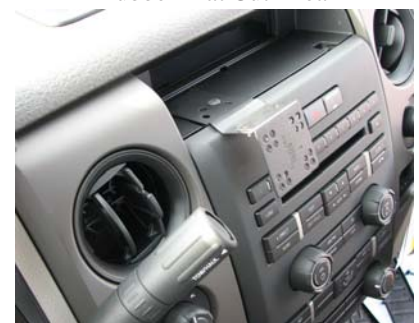
Mount in Place with Mounting Plate in Left Side Down Position