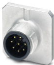
Sensor/actuator flush-type connector, 8-pos. plug, M12, A-coded, front/square flange mounting, wave soldering

Please be informed that the data shown in this PDF Document is generated from our Online Catalog. Please find the complete data in the user's documentation. Our General Terms of Use for Downloads are valid ( http://phoenixcontact.com/download )