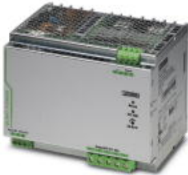
Primary-switched QUINT POWER power supply for DIN rail mounting with SFB (Selective Fuse Breaking) Technology, input: 1-phase, output: 48 V DC/20 A

Please be informed that the data shown in this PDF Document is generated from our Online Catalog. Please find the complete data in the user's documentation. Our General Terms of Use for Downloads are valid ( http://phoenixcontact.com/download )