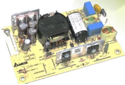
50.8(W) x 30.5(H) x 101.6(L) mm