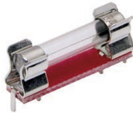
BK-6004 w. 3AG Fuse

Low-profile, snap-in design, PC retention for wave soldering, available with legs for critical alignment during PC installation, available with or without stops. Rated 6.3 to 30 Amps.