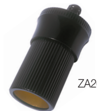
Auto Cigarette Socket