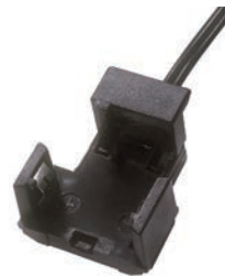
Lead Acid Clip