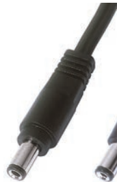
DC Plugs- Straight