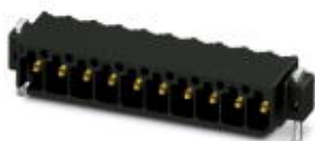
The figure shows the 10-position version

PCB headers, nominal current: 6 A, rated voltage (III/2): 160 V, number of positions: 14, pitch: 2.54 mm, color: black, contact surface: Gold, mounting: SMD soldering, Fixed coding of the first position, can be combined with the FMC 0,5/...-ST-2,54 C1 connector