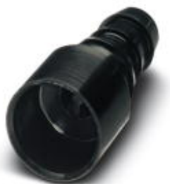
Pneumatic socket, for HC-M-PN2 module, internal hose diameter of 6.0 mm

Please be informed that the data shown in this PDF Document is generated from our Online Catalog. Please find the complete data in the user's documentation. Our General Terms of Use for Downloads are valid ( http://phoenixcontact.com/download )